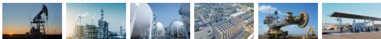
(1) Petroleum and petrochemical industry (2) Chemical plant (3) Pharmaceutical (4) Natural gas (5) Mining industry (6) Gas station